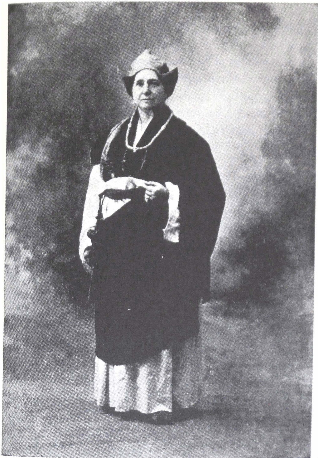
ALEXANDRA DAVID NEEL Wearing her monastic robes in Tibet