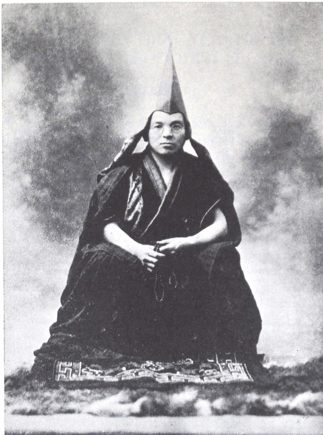
THE LAMA YONDGEN